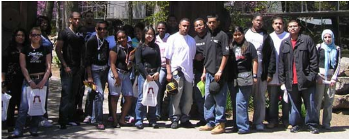
Communications Academy students at the Ramapo College Arch